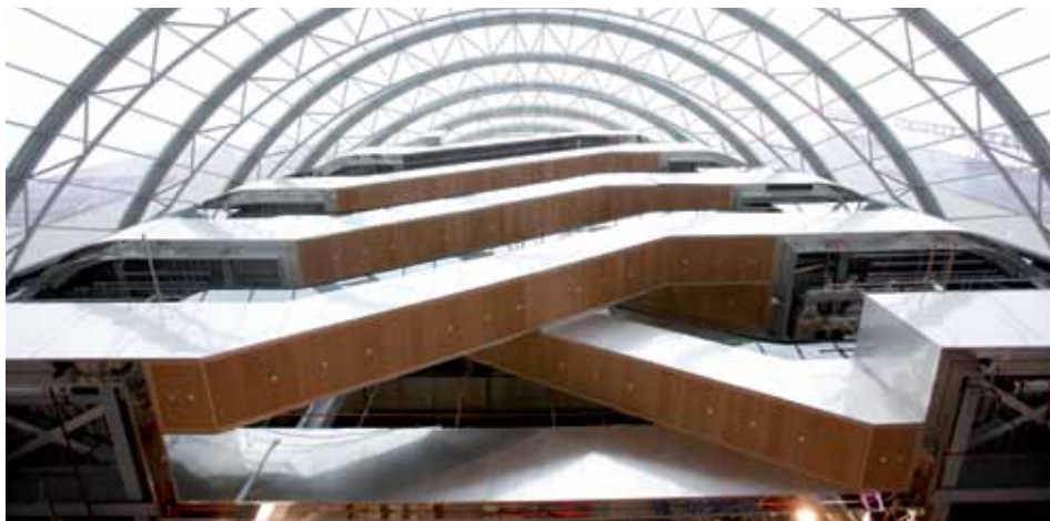
The spectacular Atrium and escalator system at The CCD

The main halls and meeting rooms are also progressing well and on target. The stone cladding and feature walls in the Foyer spaces