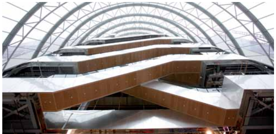
The spectacular Atrium and escalator system at The CCD

The main halls and meeting rooms are also progressing well and on target. The stone cladding and feature walls in the Foyer spaces