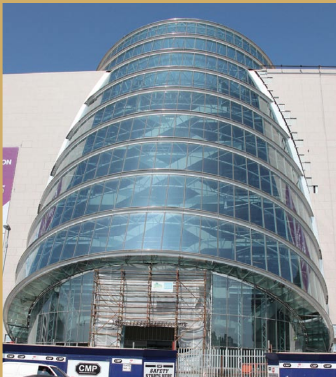
The CCD, April 2009

In our last issue we were delighted to show you images of the fantastic glass atrium. As you can now see, the glazing has been finished and the gutter strips are in place throughout the atrium. Stone cladding is complete on all elevations and roofing work is well progressed. The horizontal windows on the east and west side of the building are currently being installed and interior works are also on target with mechanical and electrical installations, internal walls, and lift and escalator installations well progressed on all levels.