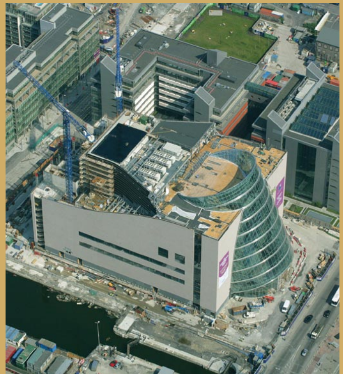
The CCD, April 2009