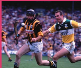
Hurling at Croke Park