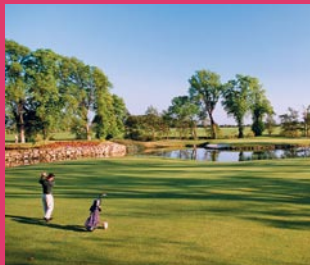
The K Club, Kildare

(If you would like us to highlight your venue or event in our next issue of 'The CCD News', email the Editor at news@theccd.ie )