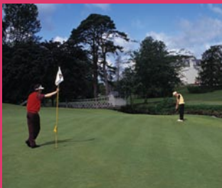
The K Club, Kildare

(The renowned Lansdowne Road Stadium is currently being re-built and will re-open in early 2010 as 'Aviva Stadium'.)